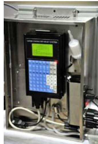
LCD for industrial machine